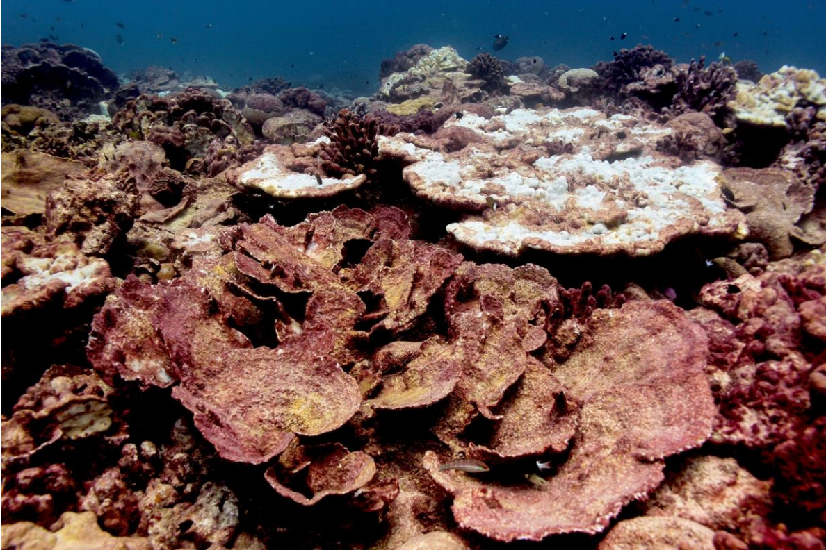
After months of heat stress, most of the reef's corals were killed, and their skeletons were coated in red-brown mats of algae. ( https://www.nationalgeographic.com/science/article/coral-bleaching-reefs-climate-change-el-nino-environment )