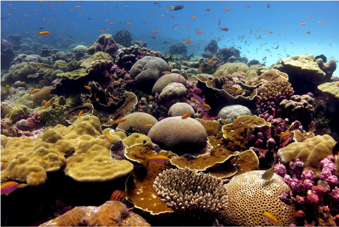
Corals on Kiritimati, Christmas Island, before the bleaching of 2015 and 2016 ( https://www.nationalgeographic.com/science/article/coral-bleaching-reefs-climate-change-el-nino-environment )